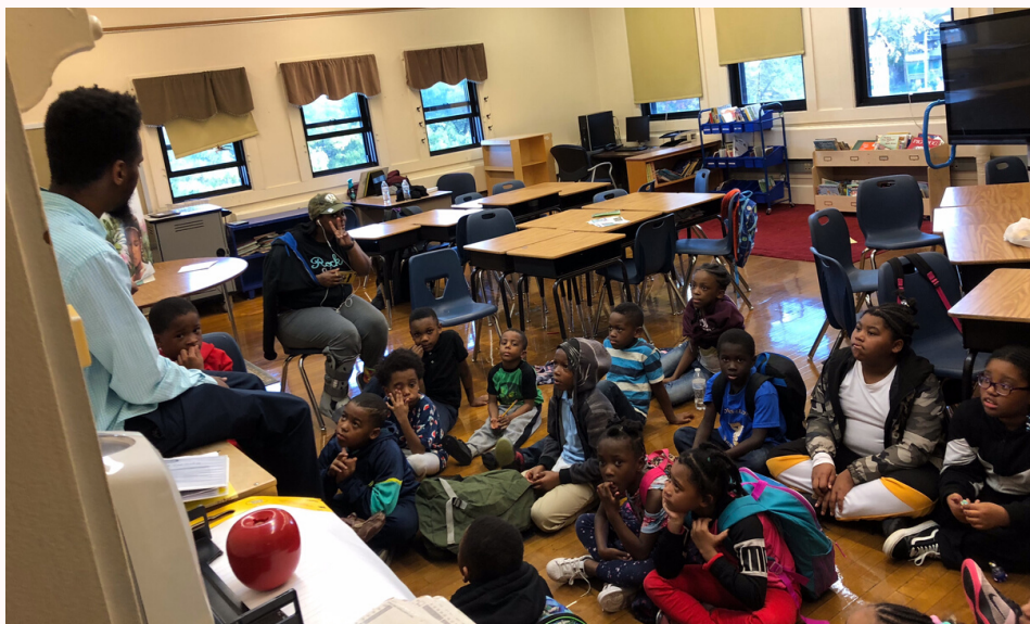
Students enjoy listening to Mr. T read a story during LitART time!

UPCOMING PROGRAMS & DATES TO KNOW PAGE 4