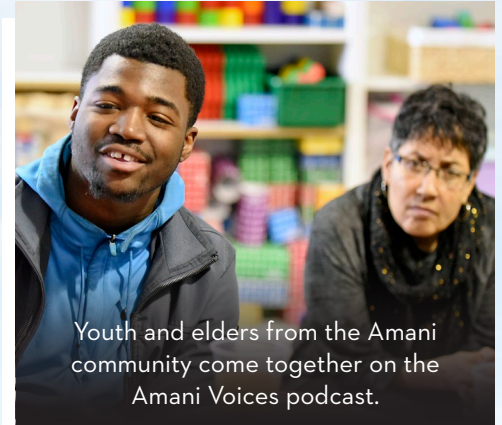
Youth and elders from the Amani community come together on the Amani Voices podcast.