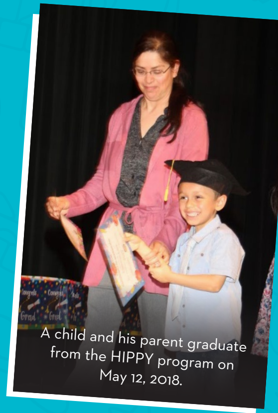
A child and his parent graduate from the HIPPY program on May 12, 2018.

6,039 home visits to families provided by HIPPY Parent Partners