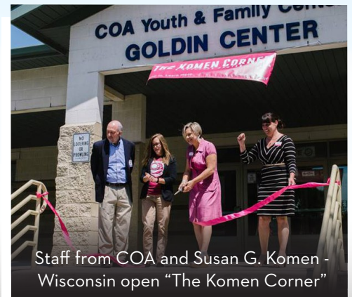
Staff from COA and Susan G. Komen - Wisconsin open "The Komen Corner"