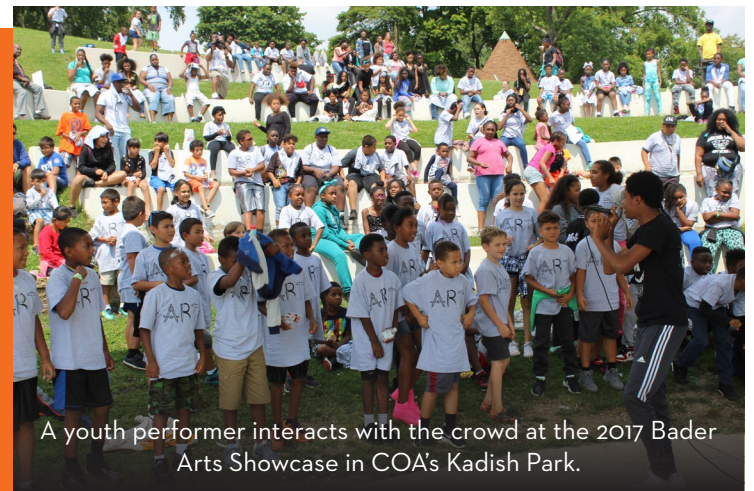
A youth performer interacts with the crowd at the 2017 Bader Arts Showcase in COA's Kadish Park.

For 50 years COA has contributed to the revitalization of the Riverwest neighborhood by providing resources that contribute to creating strong families. Our nationally accredited Early Education Center, Family Resource Center, and quality youth development programming serve children, strengthen families, and build community. COA worked with the City to create Kilbourn-Kadish Park with its sports field, community gardens, and the Selig-Joseph-Folz Amphitheater where the community unites each summer to enjoy COA's fun-filled Skyline Music Series and other events!