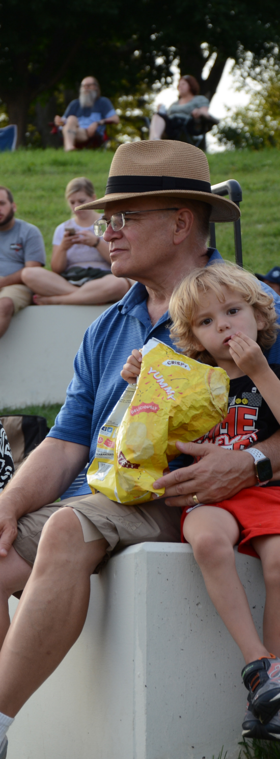
Enjoying live music at Skyline Music Festival.