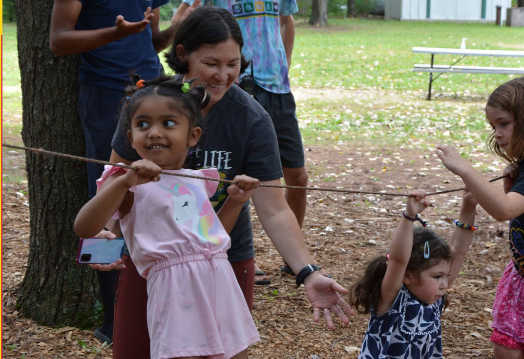
Fun at Camp Helen Brachman's Summer Camp.